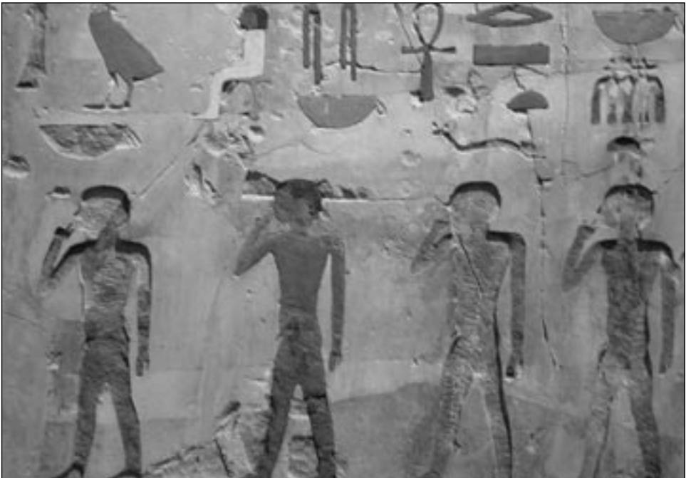
Hieroglyphs

The consciousness of the tribal cultures was intimately related to the cosmos and to the fertility cycles of nature. Thus there was established a rich and creative harmony between primal peoples and the world of nature, a harmony which was explored, expressed, and celebrated in myth and ritual.